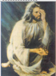
THIS MUST STOP! Jesus Weeping (holy card size)